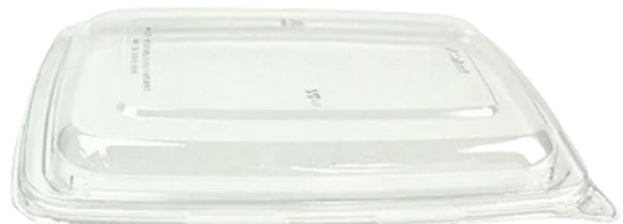
RECYCLABLE PET PLASTIC LIDS