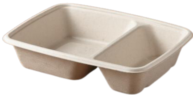
PULP FIBER CONTAINERS

"We strive to create a circular economy"