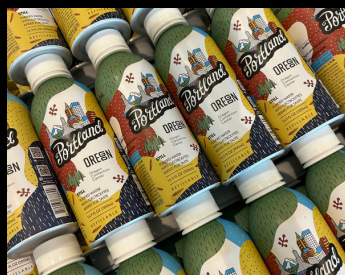
PATH REFILLABLE BOTTLED WATER IN PORTLAND, OR