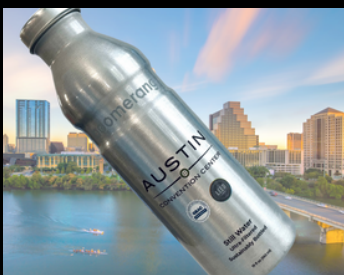
BOOMERANG BOTTLED WATER PROGRAM IN AUSTIN, TX