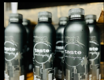
PATH REFILLABLE BOTTLED WATER IN LOS ANGELES, CA